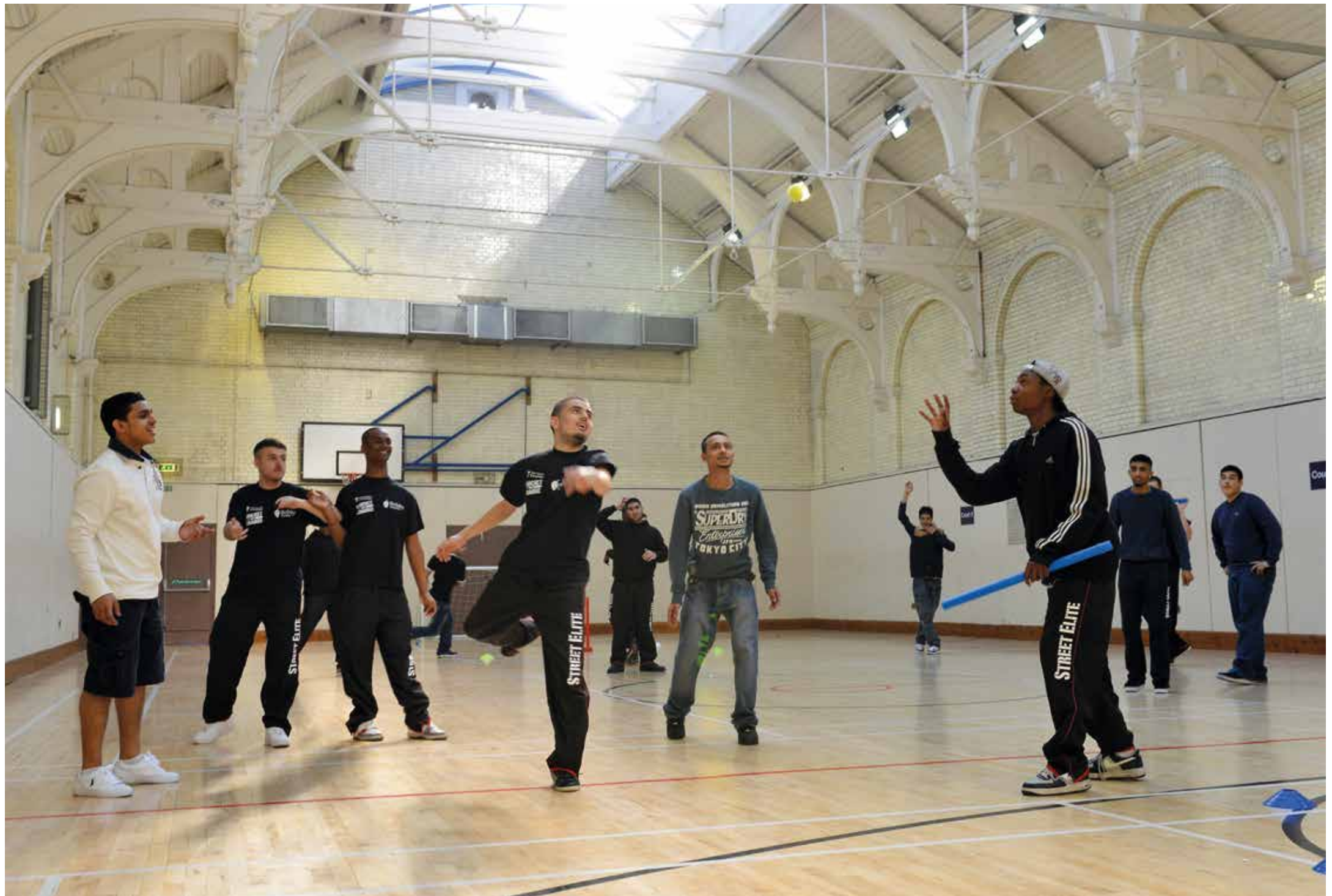
Early days: a training session to build trust and teamwork skills