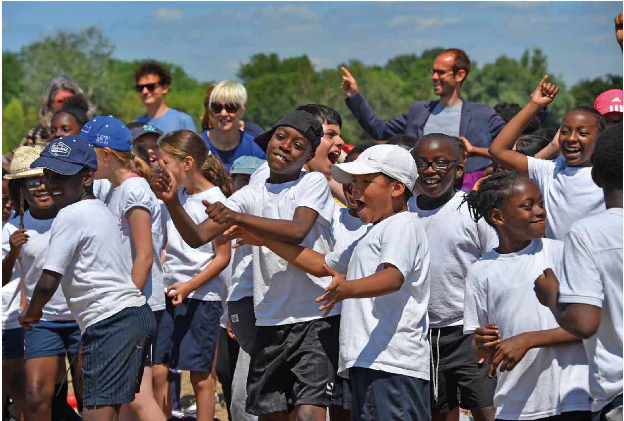
A Street Elite Festival in Southwark, celebrating with local schools